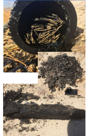
Leachate Scale Affecting Otay Landfill Force Main

Drawing to the right was used to determine FM affected area and FlowScience Leachate Scale Control System Placement and Design